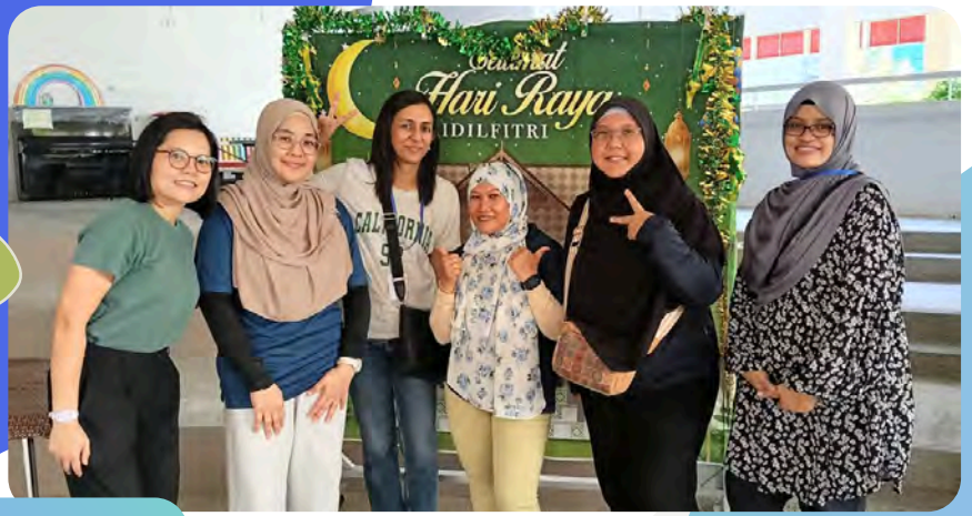
Hari Raya Hall Decoration Our parent volunteers also decorated the school hall in preparation for the school's Hari Raya celebration in April!