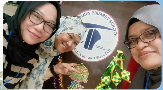
The highly anticipated Hari Raya Recess Programme gave our students the opportunity to don traditional clothing at the festive photo booth, learn to wrap ketupat and try out Malay Dance under the guidance of our PSG volunteers!